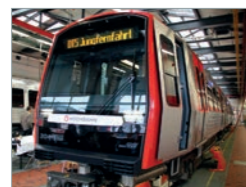
DT5, Hamburg Germany