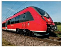
Talent 2 Germany