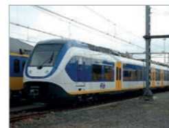
Sprinter Lighttrain SLT Netherlands