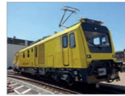
HARSCO EHFZ, SBB Germany