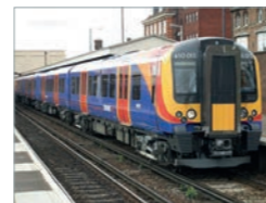
Desiro UK Class 450 Germany