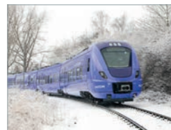
Coradia Nordic X60 Sweden