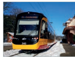
NET 2012 Germany