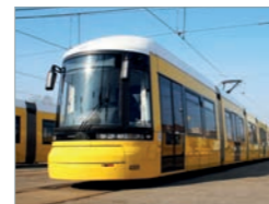
Flexity, Berlin Germany