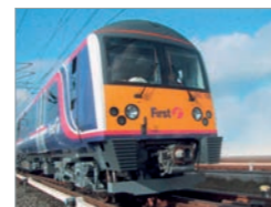
Desiro UK Class 360 Germany