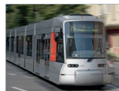
NF8U, Rheinbahn Düsseldorf Germany