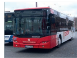
Neoplan Centroliner bus Germany