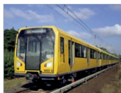
H01, Berlin underground Germany