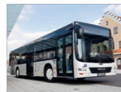
Man Lion's City bus Germany

You can find our current references online at: www.train-ing-gmbh.de