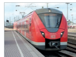
Coradia Continental Germany