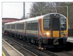
Desiro UK Class 444 Germany