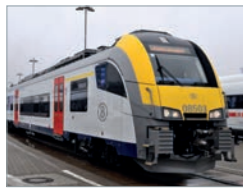
Desiro ML AM08 Belgium