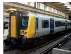
Desiro UK Class 350 Germany