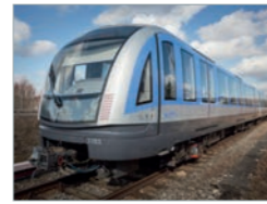
MVG C2, Munich underground Germany