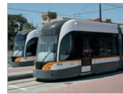
Flexity, Valencia & Alicante Spain