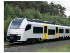
Desiro ML, MRB Germany