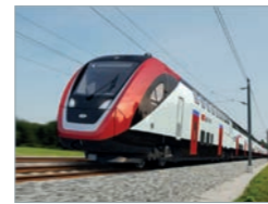
Twindexx Swiss Express Germany