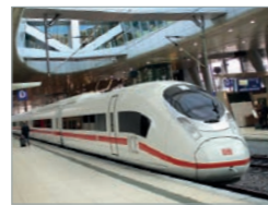
Velaro D Germany